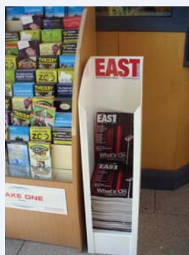
Park & Ride