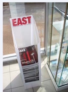
Park & Ride