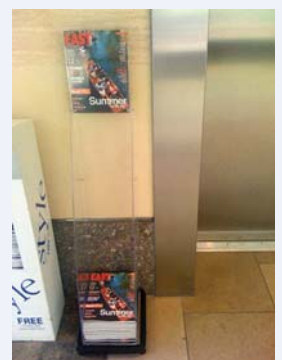
Grand Arcade, Cambridge